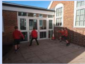
Children inviting others to play a game