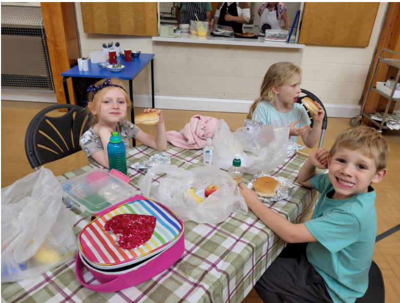
Lunch and arts-and-crafts at Foxwood Community Centre during our summer 2022 HAF session

The Holiday Activities and Food Programme (HAF) is holiday provision for school-aged children from reception to year 11 who receive benefits-related free school meals. These holiday activities are available during the Easter, summer, and Christmas school holidays and include a nutritious meal along with a variety of enriching activities.