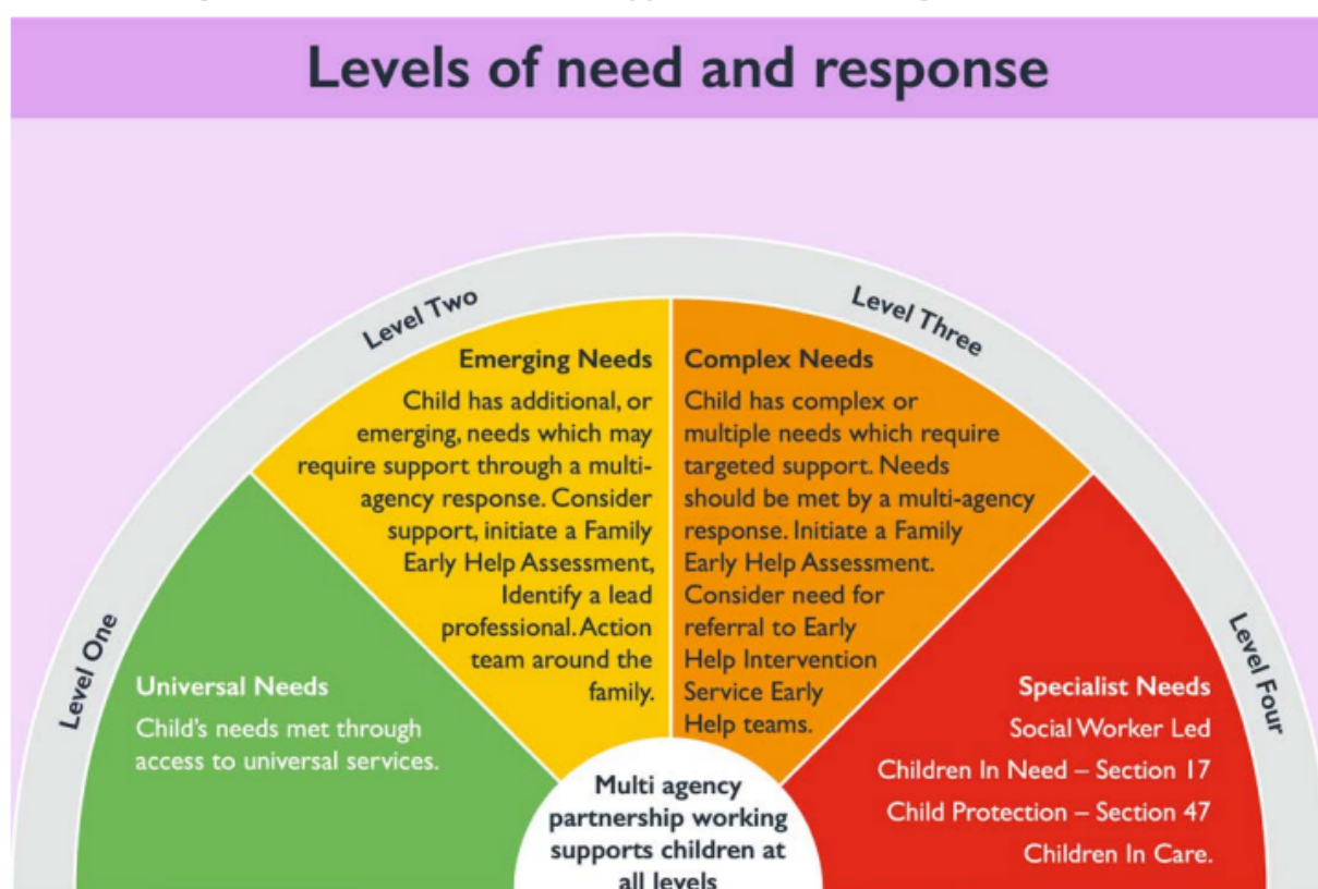
Fig 1b: City of York Council – levels of need